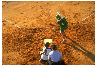
Softball starts off the season on the right foot with a big win.