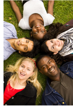
Working together we can build a better WRMS.

In addition to the Second Step program, West Middle will also begin a peer mediation program this year where students will be specially selected and trained to mediate disputes among students and take proactive steps before a problem becomes one requiring adult interven-