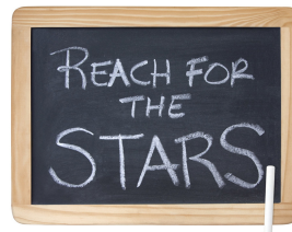
Make the most of your new year at West Rowan.

If you're a 6th grader, don't be scared or stressed. 6th grade can be very fun. And in 7th grade, being in the middle is very cool. You're not responsible for being at the top, and you're not stressed over being at the bottom.